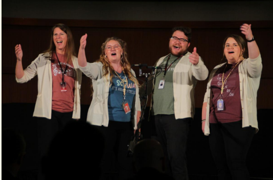
Come On, Get Happy!