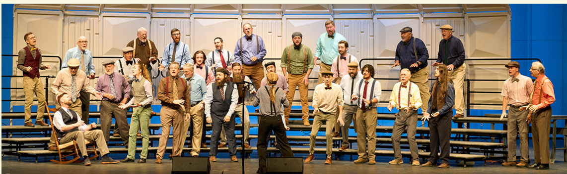
Land of the Sky Chorus: District Chorus Champs! April 2024

or Go to GoFundMe.com and search for: asheville-chorus-denver-2025