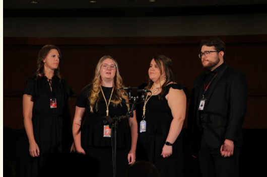
She Used to Be Mine