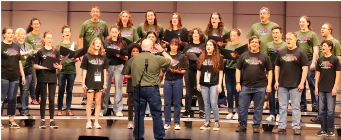
HX chorus on stage Saturday night, 2023